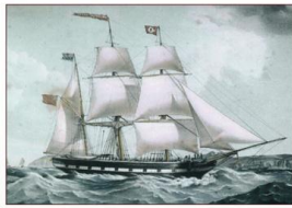
The Southern Cross in 1853, one of the ships used to carry emigrants to Australia. The voyage took over three months.