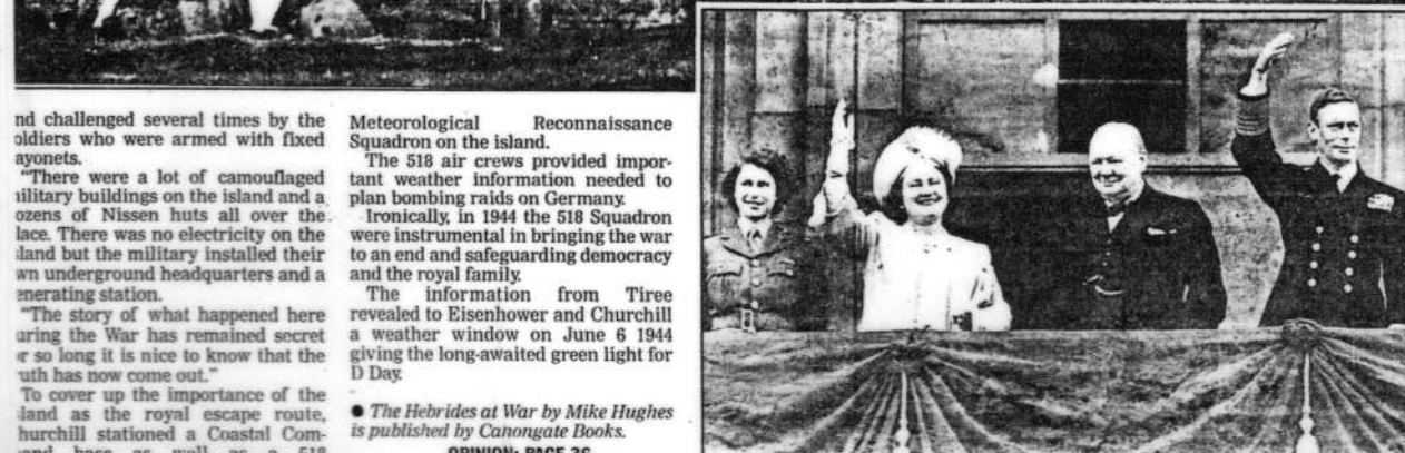
FLIGHT TO SAFETY: In the event of a Nazi invasion, Winston Churchill planned to fly the Royal Family to the relative safety of the Scottish islands before sending them on to North America if the Germans were not repulsed

nd challenged several times by the oldiers who were armed with fixed ayonets.